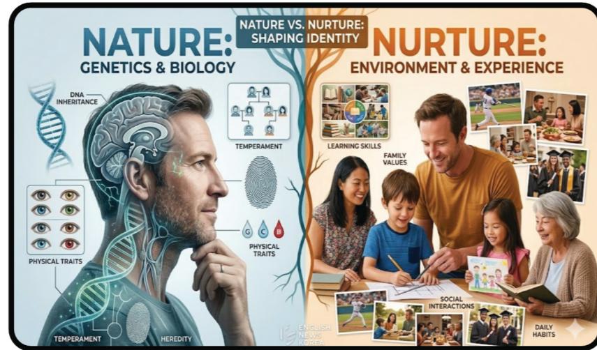
Is nature or nurture more important?

Have you ever wondered why you share your father's smile or your mother's temper? This is the classic debate of nature versus nurture. On one hand, nature refers to the biological traits passed down through genetics. Your DNA determines your physical appearance and can even influence your temperament and personality. On the other hand, nurture represents your environment, opportunities, and how you were raised. If you grew up in a household that values music, you might become a talented pianist regardless of your genes. The interaction between these two forces is extremely complex, and scientists often struggle to separate them completely. Most experts now agree it is a combination of both. While biology provides the essential blueprint, our family's daily habits, encouragement, and values, fundamentally shape who we eventually become. Whether it is inherited talent or learned behavior, our family remains our primary and constant influence.