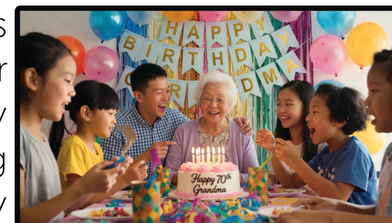
A birthday party

Last Sunday was my grandmother's birthday. My whole family went to her house for a party. It was a very sunny day. My mother made a big chocolate cake. It was delicious! My father grilled meat in the garden. We played games and listened to music. My cousins were there too. We gave my grandmother a beautiful present. She was very happy and she smiled a lot. We ate dinner and sang "Happy Birthday" together. It was a great party. I love family celebrations because we are all together. We had a wonderful time!