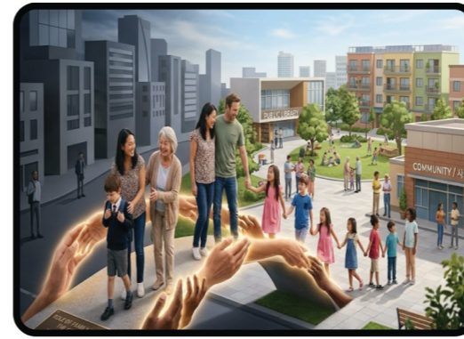
Family is a bit like a bridge

The family unit is often regarded as the fundamental building block of society, serving as the primary institution for socialization, cultural transmission, and economic stability. Beyond providing emotional support, families play a critical role in shaping a child's educational outcomes and future civic contributions, effectively instilling values that will govern a lifetime. However, in the 21st century, the traditional concept of family is undergoing a significant paradigm shift. Sociologists now examine how diverse structures, ranging from multi-generational households to "chosen families", impact social cohesion and our collective sense of identity. In rapidly aging societies, the family's role in elder care also presents complex economic challenges. Ultimately, while the definition of family continues to evolve, its function as a safety net remains indispensable. The family remains the cornerstone of a stable society, bridging the gap between the isolated individual and the broader community.