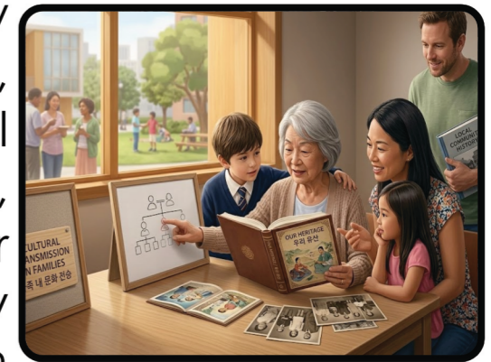
Family teaches us

The family unit is often regarded as the fundamental building block of society, serving as the primary institution for socialization, cultural transmission, and economic stability. Beyond providing emotional support, families play a critical role in shaping a child's educational outcomes and future civic contributions, effectively instilling values that will govern a lifetime. However, in the 21st century, the traditional concept of family is undergoing a significant paradigm shift. Sociologists now examine how diverse structures, ranging from multi-generational households to "chosen families", impact social cohesion and our collective sense of identity. In rapidly aging societies, the family's role in elder care also presents complex economic challenges. Ultimately, while the definition of family continues to evolve, its function as a safety net remains indispensable. The family remains the cornerstone of a stable society, bridging the gap between the isolated individual and the broader community.