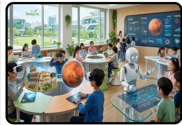
A future classroom?

What do you think classrooms will look like in the future? Imagine walking into a school where books are replaced by holograms and your classmate is a robot. By the year 2050, technology might completely transform how we learn. In the