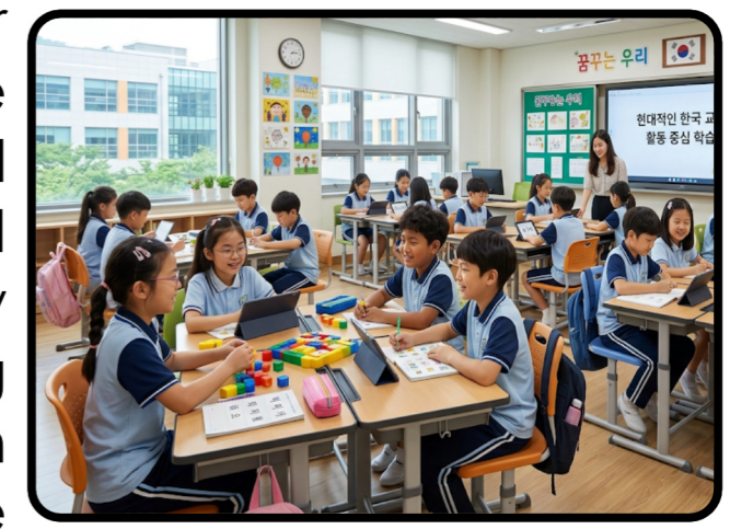
A Korean classroom in 2026

future, virtual reality (VR) could allow students to take field trips to Ancient Rome or the surface of Mars without leaving their desks. Furthermore, artificial intelligence (AI) will likely act as a personal tutor for every child. If you struggle with a math problem, the AI will recognize your difficulty and explain the concept in a way that fits your specific learning style. However, this transition raises important questions. While robots can provide facts, can they teach us empathy or teamwork? As we integrate more technology into education, maintaining the "human touch" will be the greatest challenge for schools in the coming decades.