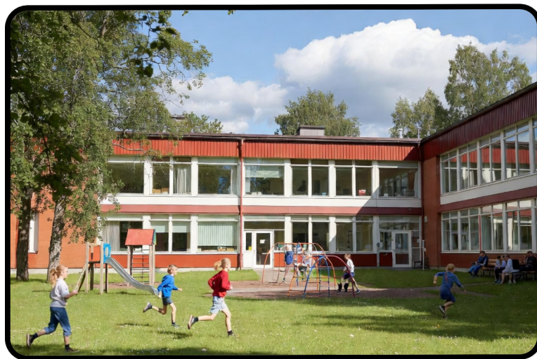
A Finnish school

Have you ever wondered what school is like in other countries? In Finland, students have a different schedule than students in Korea. Finnish students usually start school later in the morning. They have many short breaks throughout the