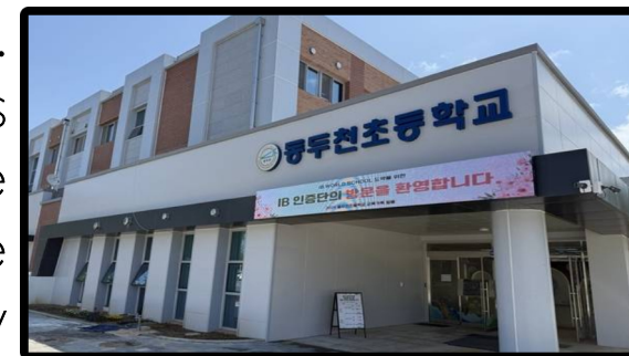
This is my school!

My school is a very special place. Every morning, the big yellow bus brings me to the front gate. I see the tall trees and the colorful flowers in the garden. Inside the building, my classroom is new, bright and clean. I sit at my desk with my best friends. We study interesting subjects like English, math, and science. My teacher is very kind and helps us learn new things every day. The best part of the day is recess. We go outside to the large playground. We run fast, jump high, and play together. My school is where I learn, play, and grow!