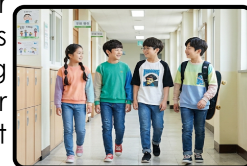
...or no school uniforms

good idea. Supporters argue that uniforms create equality. Since everyone wears the same clothes, students do not feel pressured to buy expensive, trendy brands to fit in. This can reduce bullying and help everyone focus on their studies instead of their appearance. Additionally, uniforms make getting ready in the morning much faster and easier. On the other hand, some people believe that uniforms limit personal expression. They argue that clothing is a way for students to show their unique personalities and creativity. Furthermore, uniforms can be expensive for parents to purchase, and students might find them uncomfortable to wear all day long. In conclusion, both sides have strong points. What do you think? Should students have the freedom to choose their own clothes, or is it better for everyone to look the same?