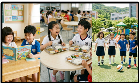
School is fun!

I go to school every day. I see my friends. In the morning, we sit at our desks. We read interesting books and write in our notebooks. We study English, math, science, PE and art. At lunchtime, we eat together. The food is very healthy and yummy! In the afternoon, we go outside. We run and play soccer on the playground. I like playing sports with my friends. I love my school!