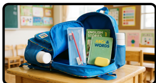
My school bag

Look at my bag! It is big and blue. I have one red pencil. I have two green books. I have one small yellow eraser. I like my bag. It is very cool! I am ready for school.